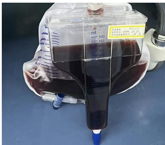
Figure 1. The urine appearing dark tea-colored with rust-like sediment.

The patient completed preoperative examinations and subsequently underwent mitral valve replacement, tricuspid valve repair under general anesthesia on March 28, 2024. The surgery lasted 3 hours and 58 minutes, with a cardiopulmonary bypass (CPB) time of 129 minutes and an aortic cross-clamp time of 81 minutes. The urine output was 1000 ml with the urine appearing dark tea-colored with rust-like sediment (Figure 1). Postoperatively, the patient was transferred to the intensive care unit (ICU) for continued treatment. Despite having good cardiac function, adequate volume and stable hemodynamics, the patient experienced oliguria, hyperkalemia and poor diuretic response during ICU. The urine remained dark tea-colored with rust-like sediment. The patient's antiretroviral medications were temporarily discontinued. She was treated with Niaoduqing granules to lower creatinine levels and stabilize renal function. Measures were taken to maintain blood volume, promote diuresis and stabilize the internal environment. Trends in the patient's creatinine levels and urine output postoperatively are shown in Figure 2. The patient was discharged on postoperative day 18.